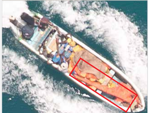
Maritime Patrol & Reconnaissance Aircraft took this image of a pirate skiff in Summer 2013. In the second image the skiff has been deployed to look for target of opportunity. Highlighted in the red box is a 3.5 metre ladder used to board high sided Merchant Vessels, it is clearly visible.